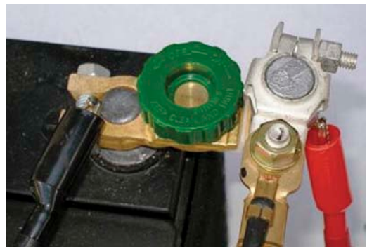
Commercially available parasitic draw test adaptor.

As with all measurements of electrical current, you sever the circuit, and insert your ammeter in-line between the two severed ends. But in this case, you can’t ever allow the two ends to become completely electrically disconnected. Current must always be able to flow, either through the battery cable itself, or “shunted” through your DMM. If the circuit gets completely opened and you re-connect the leads, one or modules in the vehicle will go into an initialization routine, boosting current flow considerably. This may or may not blow your meter fuse, but it will definitely give you an incorrect reading. You have to wait until that process completes and they are ready to go to sleep before you can try again. On some vehicles, you can use a scan tool to command modules to quickly go to sleep, which is a time-saver